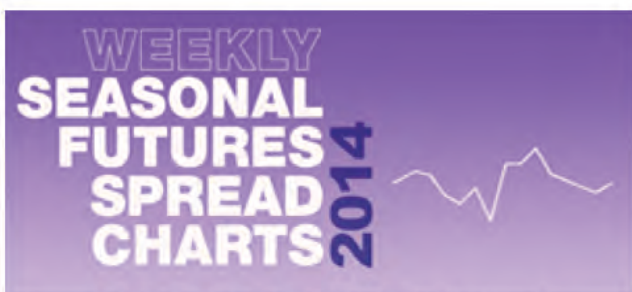
A Chart Study of Weekly Seasonal Tendencies in Spreads

A classic must have reference work for traders; this detailed chart study shows most popular futures SPREADS week by week and direction as a composite chart. At a glance you will know typical market direction and normalized size of move. Complete with instructions! Spot strong seasonal high odds spread moves easily. There is no study out there like this one. Covers a vast amount of history.