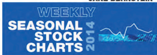
A Chart Study Of Weekly Seasonal Tendencies In Stocks

A classic must have reference work for traders, this detailed chart study shows many actively traded stocks week by week and their seasonal direction as a composite chart. At a glance you will know typical market direction and normalized size of move. Complete with instructions! Spot strong seasonal high odds moves easily. There is no study out there like this one. Covers a vast amount of history.